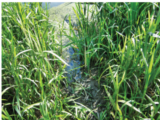
Fig. 4. A beaver slide.