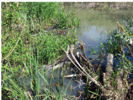
Fig. 2. A part of the first beaver dam.