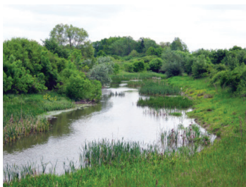
Fig. 7. The channel's course at location 3 (see fig. 8).