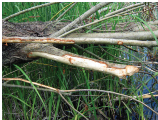
Fig. 5. Recently gnawed branches of a juvenile aspen.