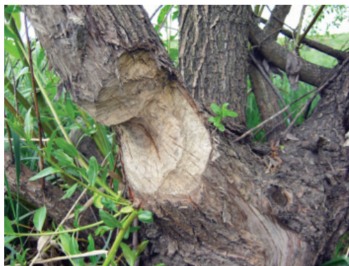
Fig. 3. A branch of a riparian willow gnawed earlier.