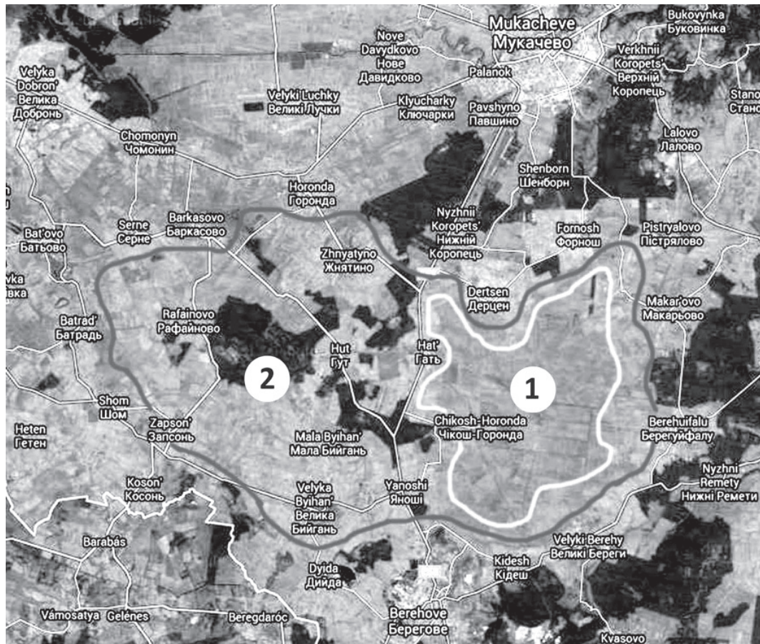
Fig. 1. The Chornyi mochar tract. Google map with modifications:

1 — the area of the former Great Lake; 2 — the general boundaries of the tract accepted in the present work.